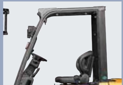
Ergonomically designed forklift enables a wide view