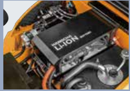
Double permanent magnet synchronous motor system