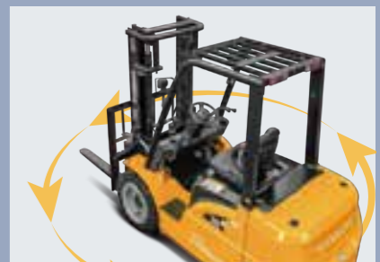
Turning radius reduced